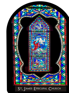
Naomi and Ruth